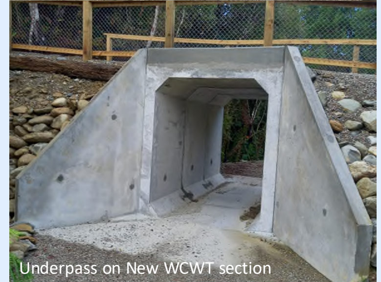
Underpass on New WCWT section