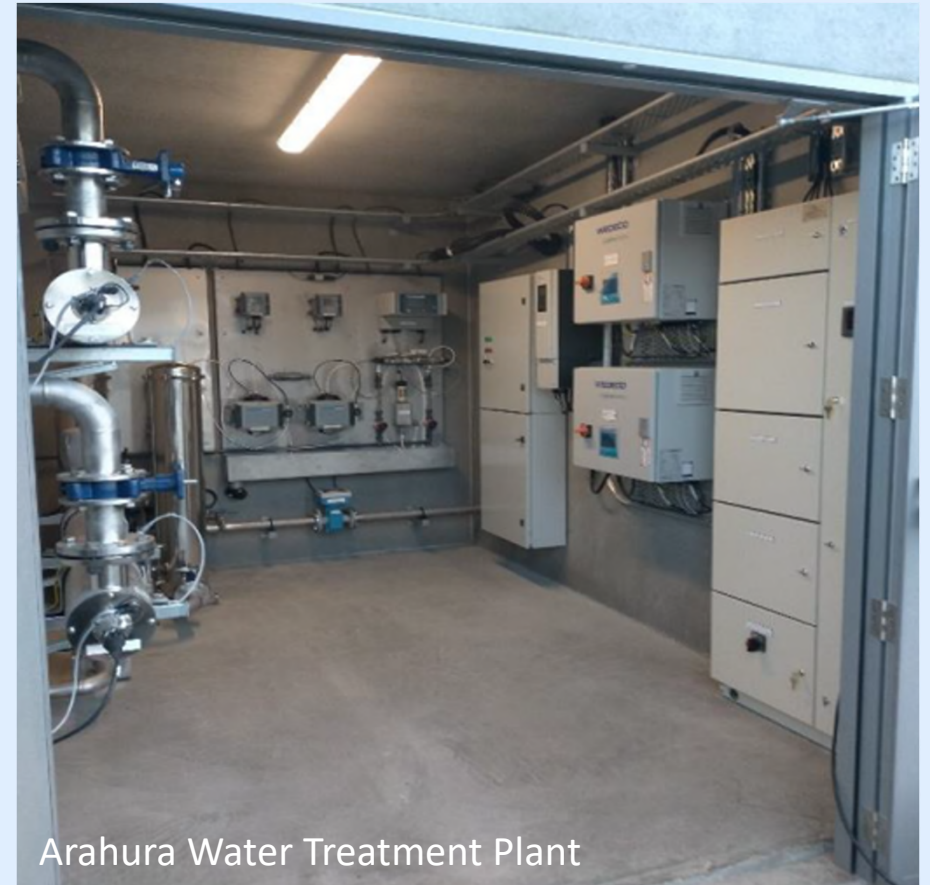
Arahura Water Treatment Plant