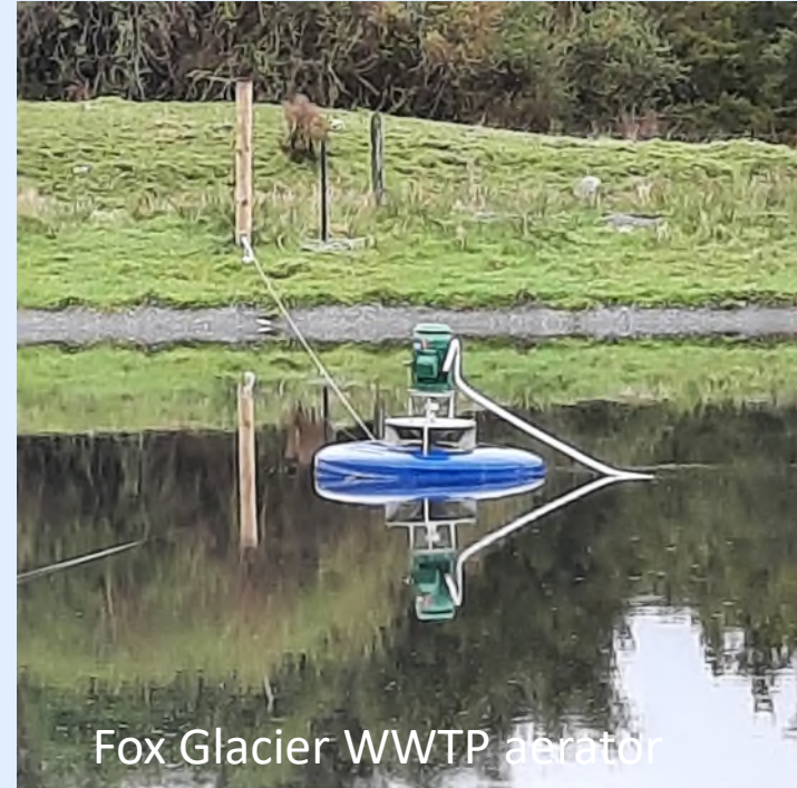
Fox Glacier WWTP aerator