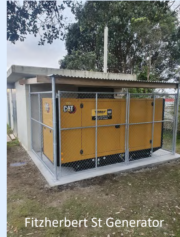
Fitzherbert St Generator