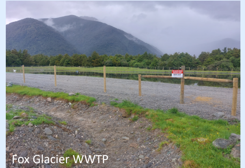
Fox Glacier WWTP