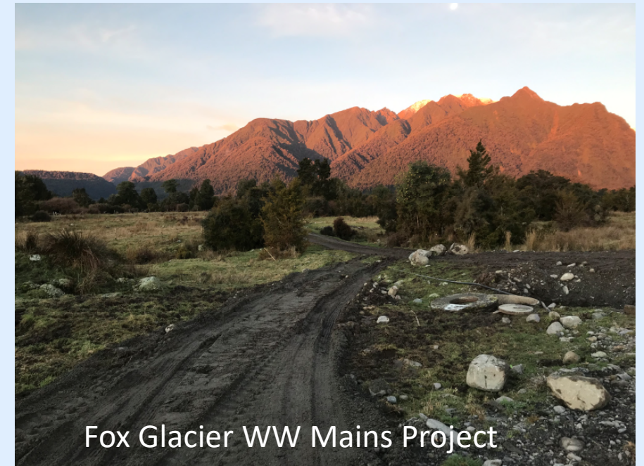
Fox Glacier WW Mains Project