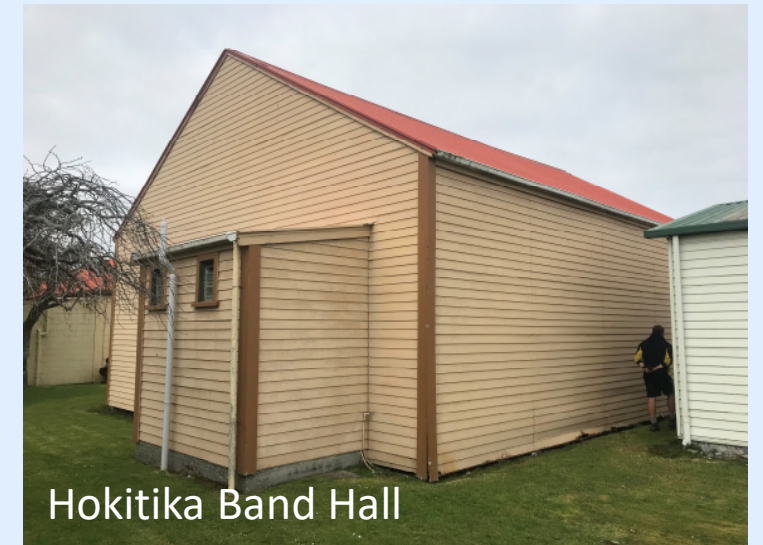
Hokitika Band Hall