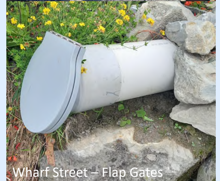
Wharf Street – Flap Gates