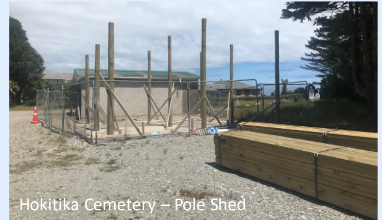
Hokitika Cemetery – Pole Shed