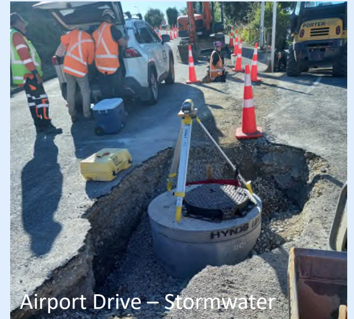
Airport Drive – Stormwater