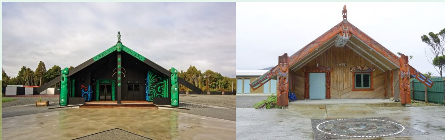
Arahura and Bruce Bay Marae

With Te Runanga o Ngati Waewae and Te Runanga o Makaawhio, to achieve conservation outcomes across the region