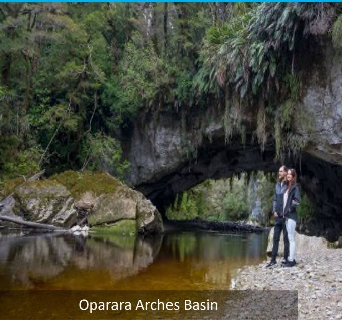
Oparara Arches Basin