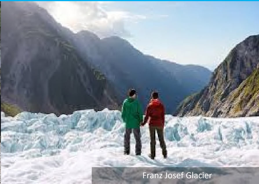
Franz Josef Glacier