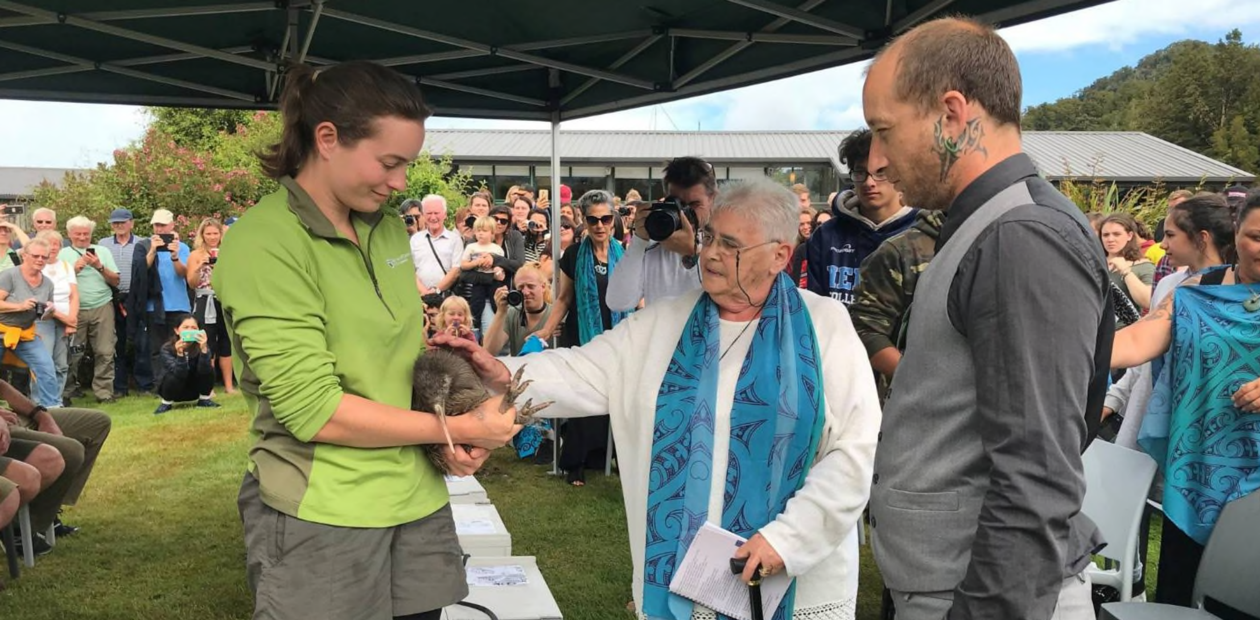
Our collaboration with others and our volunteers enables us to achieve conservation outcomes across Te Tai Poutini ... and to connect with our communities