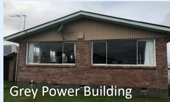
Grey Power Building