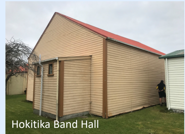
Hokitika Band Hall