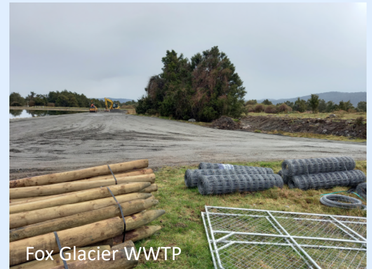
Fox Glacier WWTP