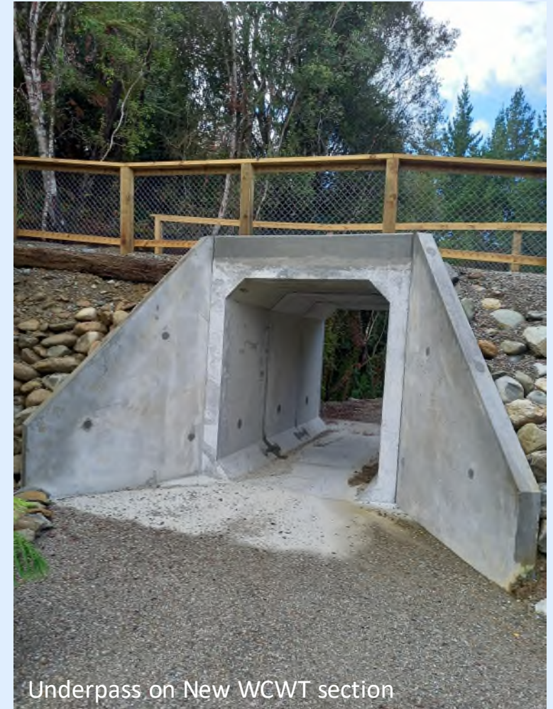
Underpass on New WCWT section