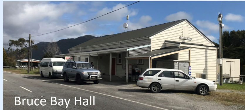
Bruce Bay Hall