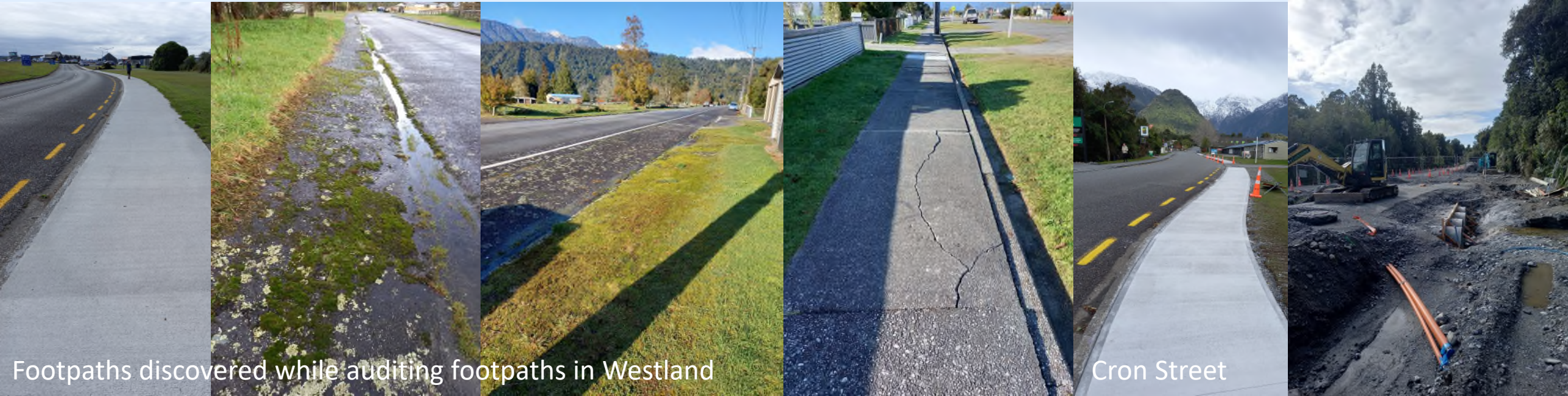
Footpaths discovered while auditing footpaths in Westland

The Cron Street extension has made good progress and is on target to be complete by November 2021. Winter weather is currently causing work delays.