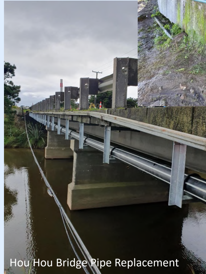
Hou Hou Bridge Pipe Replacement