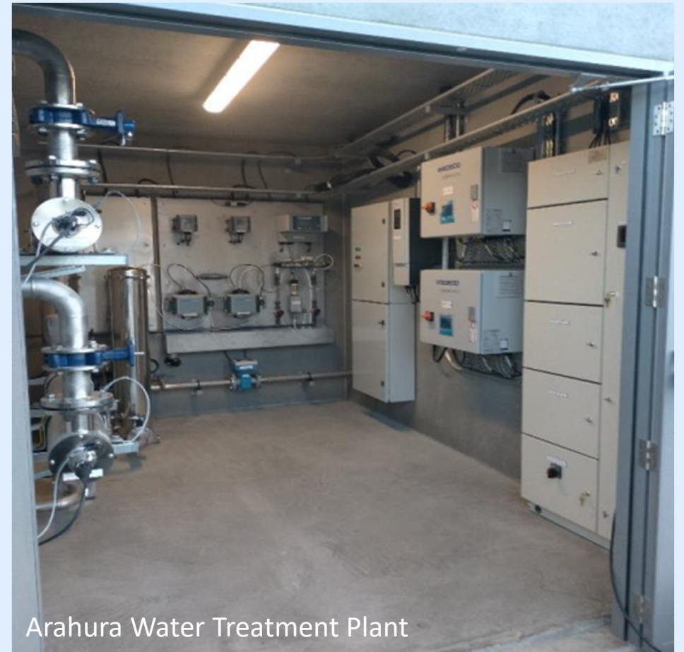
Arahura Water Treatment Plant