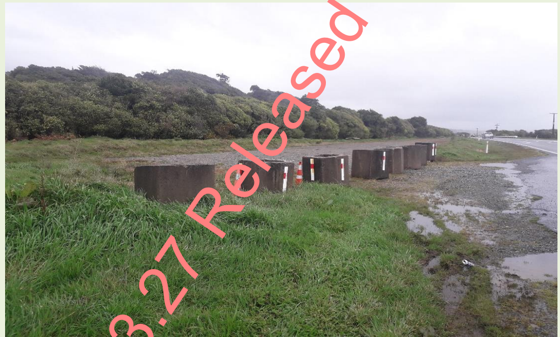
Now closed due to public complaint