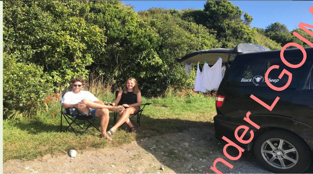
Acre creek (NZTA road side rest area) functioning as a freedom camping area.