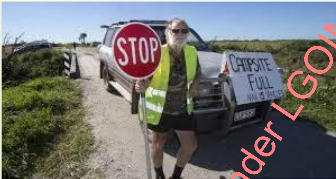
Kakapotahi, freedom camping site now closed due to public intervention,