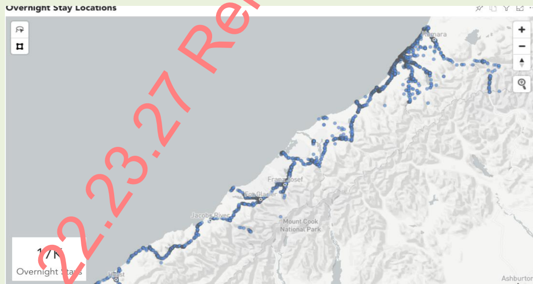
Figure one Overnight stay location for freedom campers

Covid impacted heavily on some parts of the Coast with many businesses who traditionally relied on international tourism for example, Franz Josef and Fox Glacier saw a significant downturn, while other areas remaining buoyant throughout the pandemic due to domestic travel. In both cases freedom camping remained popular and without additional funding Westland struggled to meet the demands related to both compliance and advocacy. With the return of International visitors it is expected that Westland will return to pre Covid conditions.